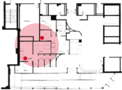
2 assets located in a zone level accurate system showing at least 13 areas that must be searched.

Even with similar location resolution, zone level accuracy requires staff to search with a larger cluster - impacting staff adoption and productivity.