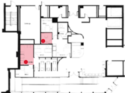
The same 2 assets located in a room level accurate system showing specific room location.

Many RTLS networks require that access points are hard-wired. In order to accomplish a hard-wired installation, holes are drilled in ceilings or walls, or ceiling tiles are removed and replaced, in order to run cable and pull power for each access point. In some cases, this hard-wired infrastructure is required in each room to accomplish room level accuracy. This can be extremely disruptive, labor intensive, time consuming and expensive. Most of these hard-wired systems further require complex planning, coordination and calibration.