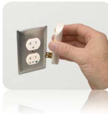
RTLS network sensor simply plugs into standard electrical outlet to form an RF mesh network

Awarepoint's ZigBee based RF mesh network technology is installed by simply plugging sensors into standard wall outlets and correlating them with known positions on floor plans. Installation of these types of sensors can be done without disruption - even in occupied hospital patient rooms, heavy traffic areas, or other sensitive locations. These plug-in mesh network sensors further provide full flexibility, as rewiring is never required. Covering new areas is as simple as plugging in additional sensors, or moving existing ones, to expand or change the network coverage. Awarepoint's ZigBee-based active RFID and RTLS technologies, wireless RF mesh network and long-life battery powered tags offer a cost effective way to collect location and status data about assets and their movement with persistent location accuracy on an enterprise-wide basis.